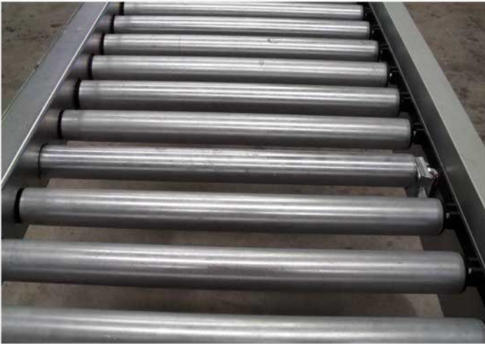
Micro - V Driven Conveyor