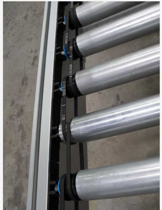
View showing drive roller and driven rollers with Micro - V drive bands