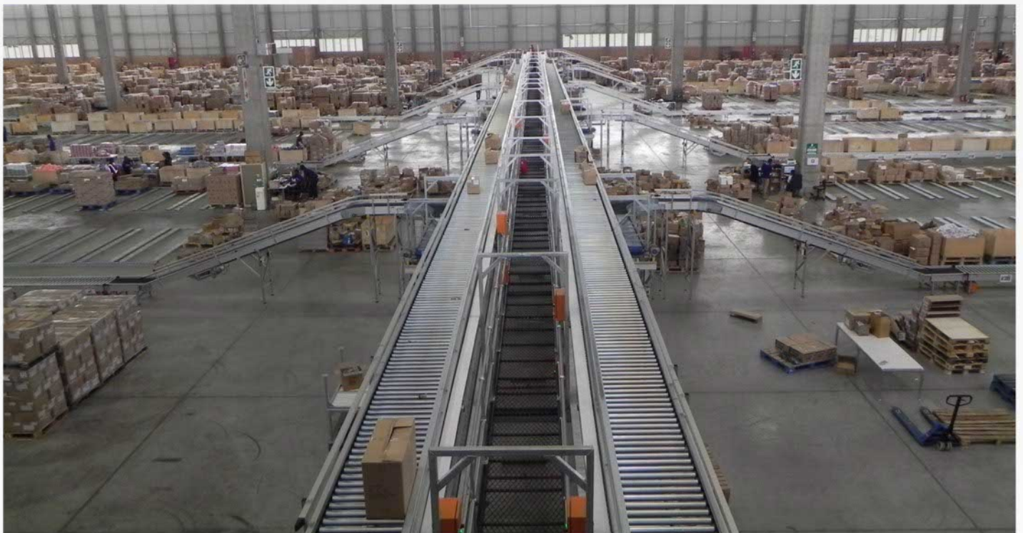
MDR ZPA Picking Conveyors

We use our standard Aluminium extruded side frame for the frame of the conveyor and mild steel electrogalvanised rollers. Conveyco has the sole distributorship for the "Pulse Roller" range of MDRs manufactured by Kyowa of Japan and the "Conveylinx" zero pressure accumulation MDR control cards manufactured by Insight Automation in the United States of America.