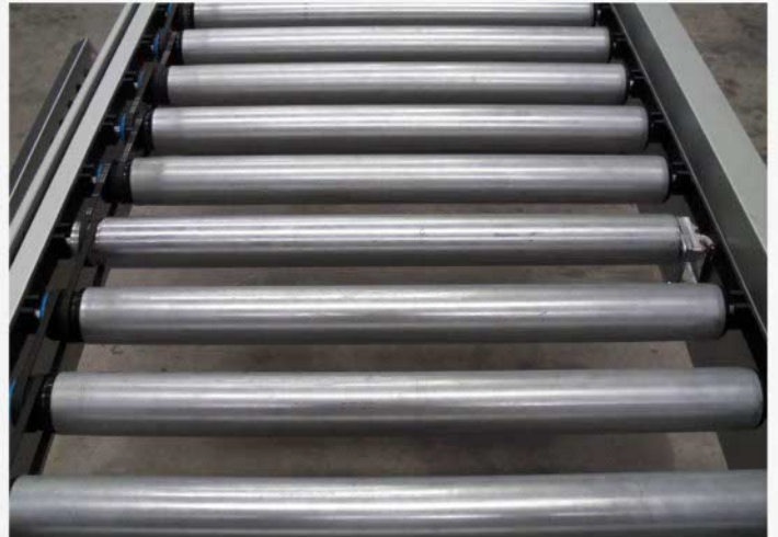
Micro - V Driven Conveyor with Guard removed

Conveyco offers motor driven roller zero pressure accumulation conveyors in various length modules. The motor driven roller (MDR) is a 24volt DC motor inside a Ø 50mm conveyor roller. The MDR is controlled by a control card which incorporates the connection for the photocell and the software to control a string of MDRs.