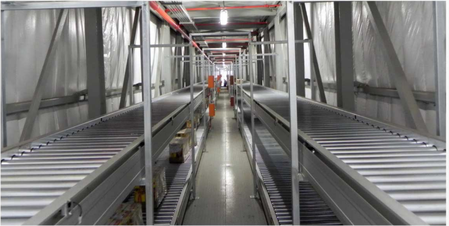
Double Tier MDR ZPA Roller Conveyors in Tunnel